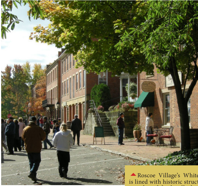
▲ Roscoe Village's Whitewoman Street is lined with historic structures, and with crowds and food stalls during the annual (October) Apple Butter Festival.